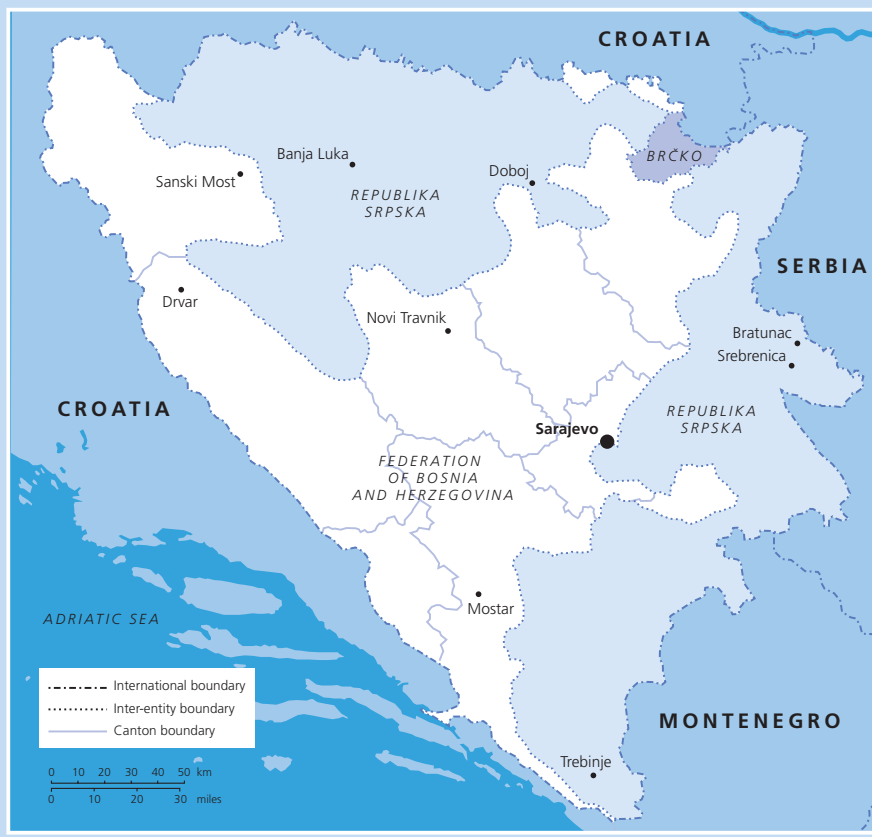
This map is intended for illustrative purposes only. Saferworld and Conciliation Resources take no position on whether this representation is legally or politically valid.

The perspectives and ideas in this Policy Brief are drawn from research carried out by Saferworld in co-operation with Nansen Dialogue Center Sarajevo and builds on the findings of report published by Saferworld in August 2010, The missing peace. The need for a long term strategy in Bosnia and Herzegovina . The research, which involved group discussions and interviews in over 10 locations across BiH, gave young people the opportunity both to voice their opinions, as well as take an active part in carrying out some of the research, thus encouraging them to analyse their own attitudes and behaviour and demonstrating what they can achieve on their own. A final validation and advocacy training workshop for the young researchers and NGO representatives took place in Sarajevo. The findings are explored in greater depth in the report Leaving the past behind: The perceptions of youth in BiH .